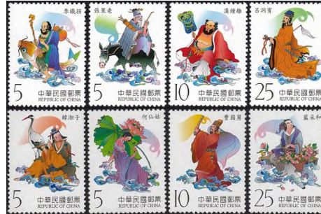
The Eight Immortals